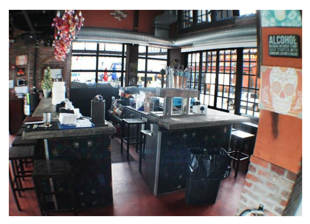
Indoor and Outdoor Bars