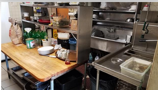
Full Basement Backup & Storage Area