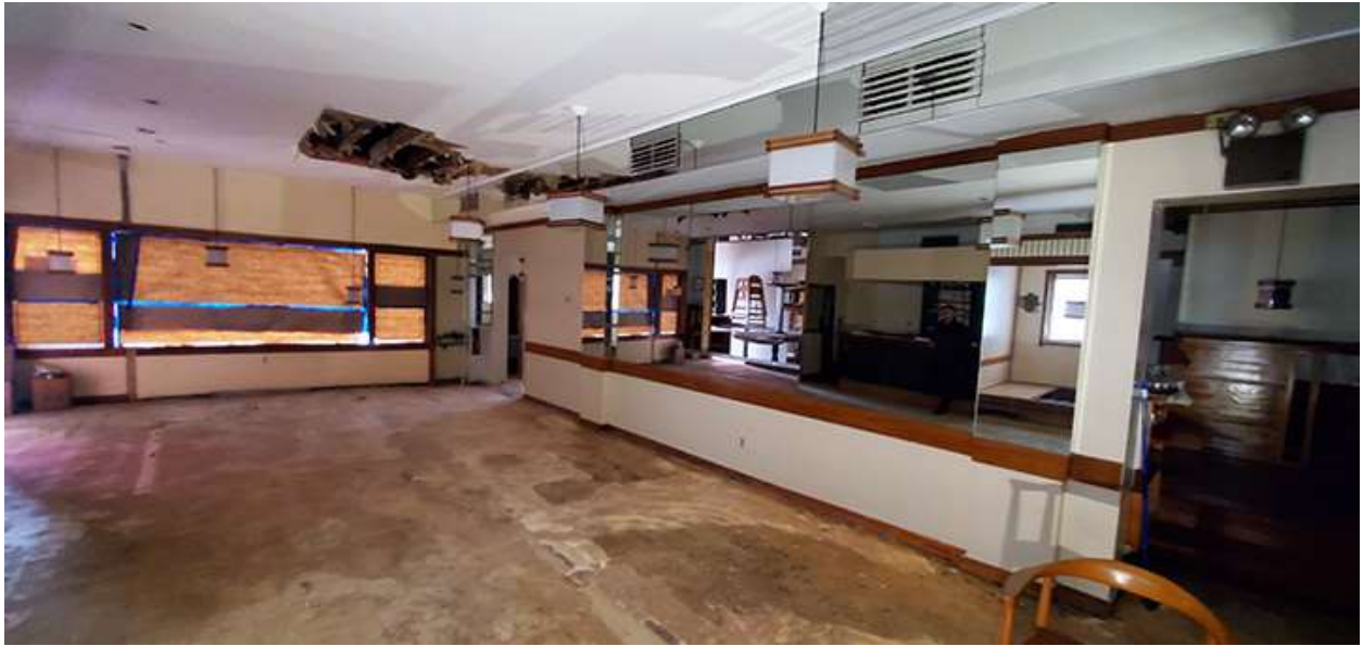
Main Room with Mirrors