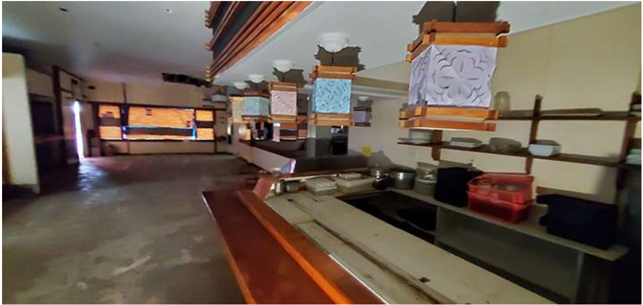
Former Main Room