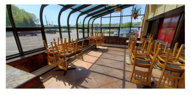
Dining Room Tables