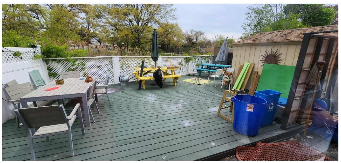
Good Location on Atlantic Avenue

16 Seat Restaurant + Outdoor Deck w/ 24 Seats on a Brook