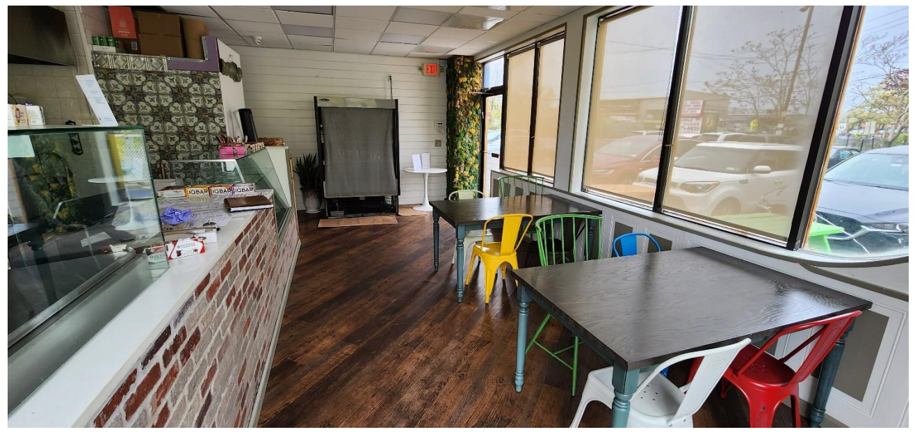
New 12' Hood and Fully Equipped Kitchen