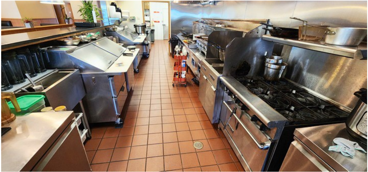
Spacious Exhibition Kitchen