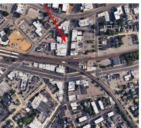
Central Location Parking In Rear All New Buildout Busy Downtown 5 Point Corner