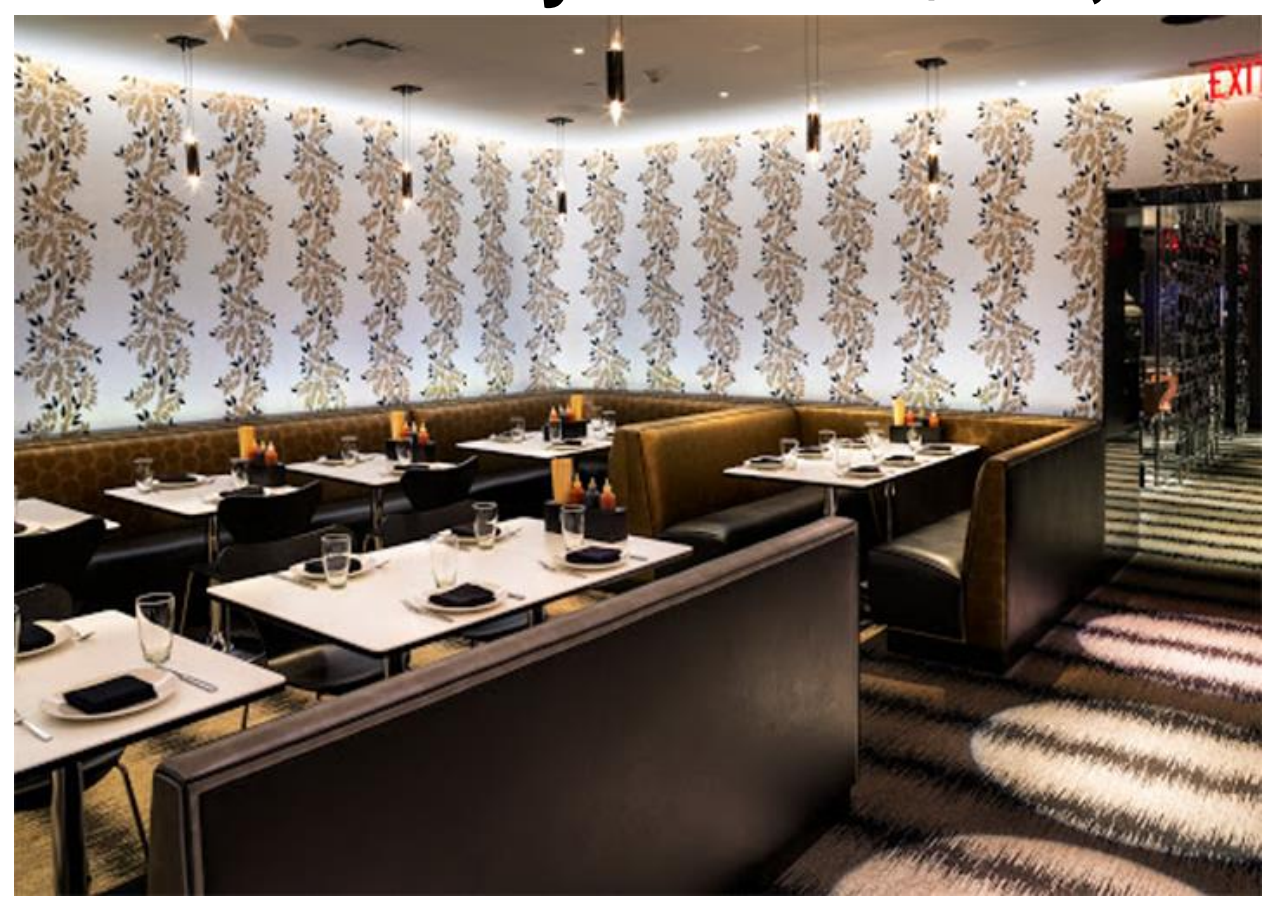
Very Active Village Downtown