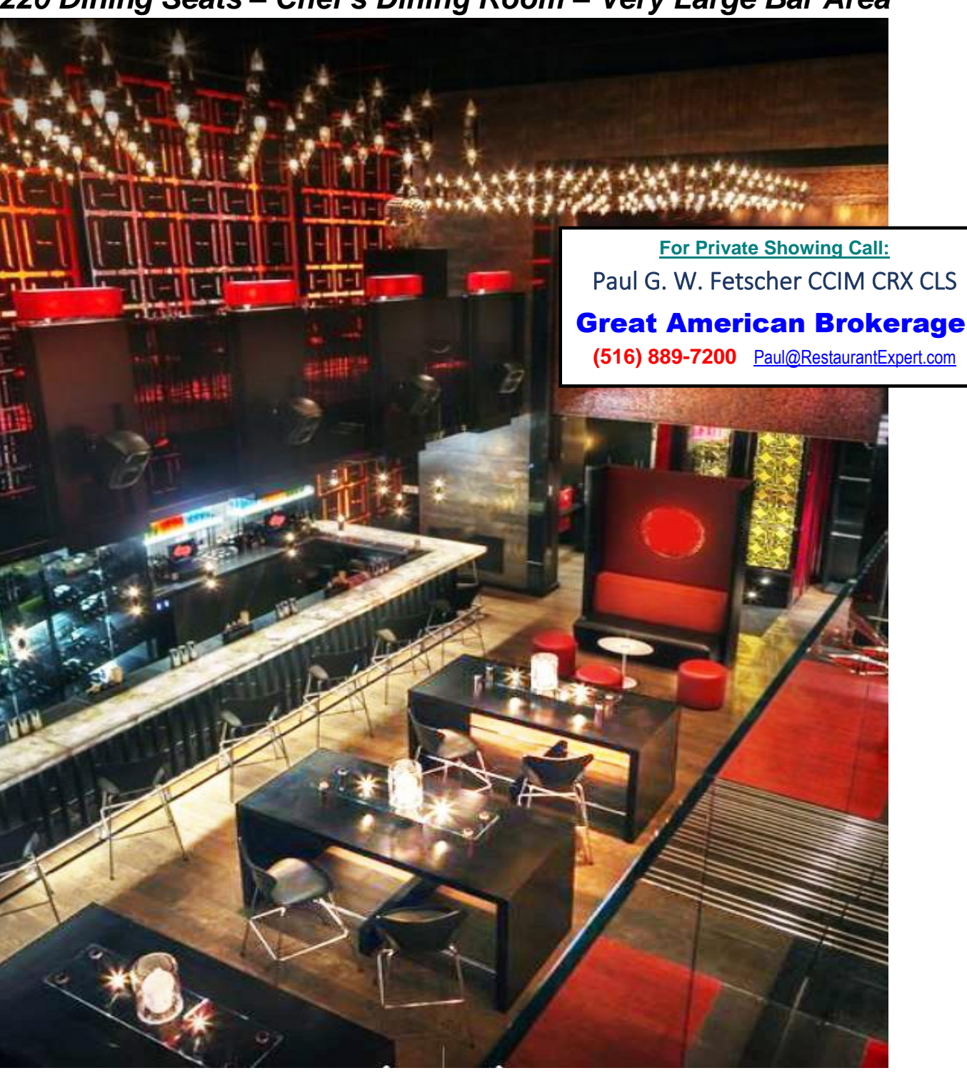
Elegant Space Must be Seen to be Appreciated

220 Dining Seats - Chef's Dining Room - Very Large Bar Area