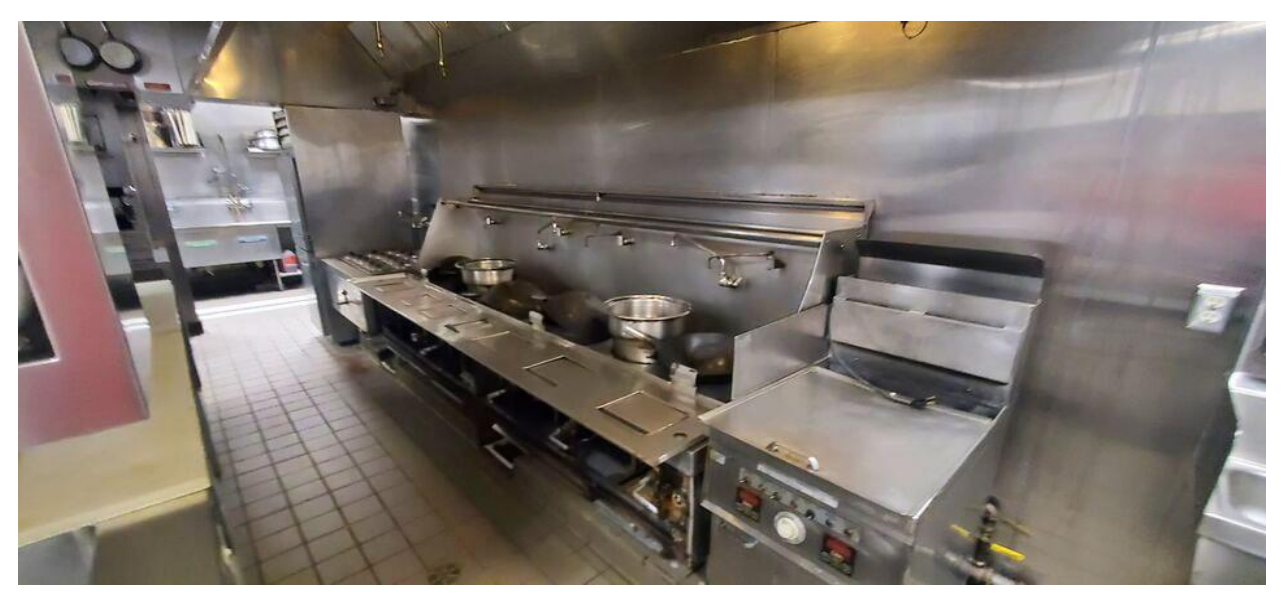
Immaculate Kitchen and Prep Areas