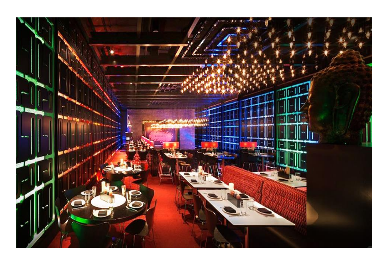
Upper Level Balcony Dining – 80 Seats