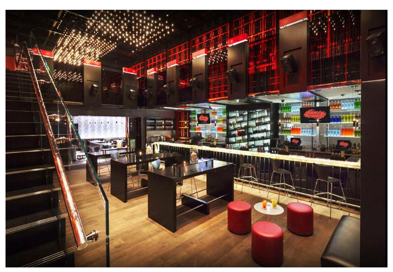
Large Bar Area