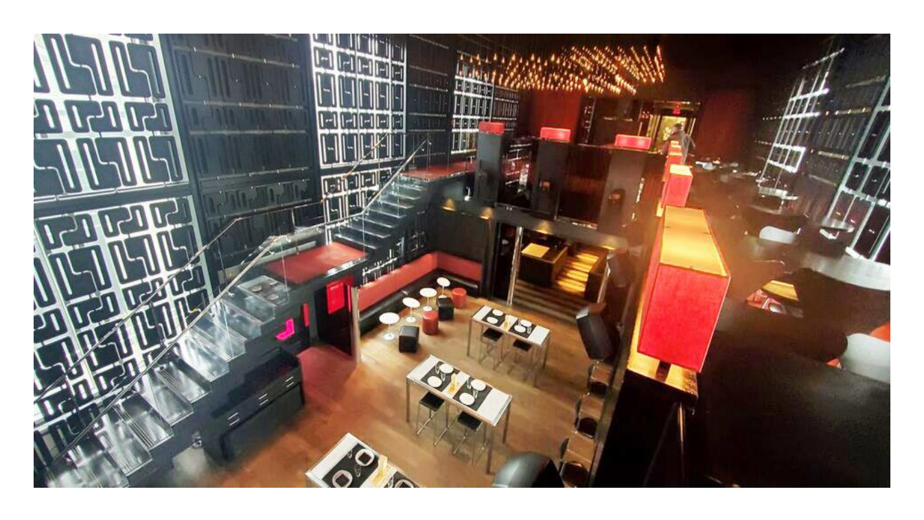
Dramatic Space 15,000 SF Total $1,200,000 Invested in Light & Sound