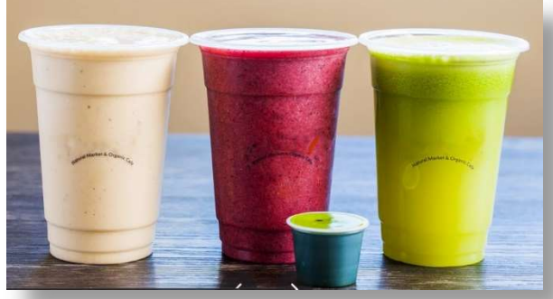
Fresh Squeezed Juices