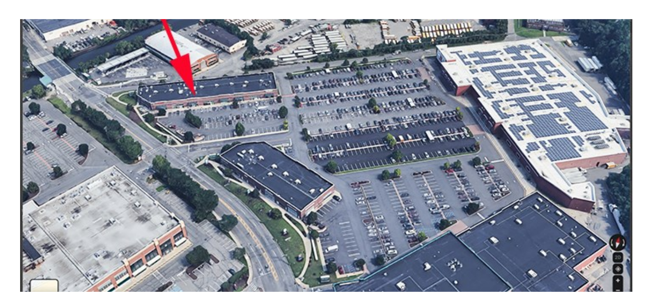
Accessible Location in a Large Shopping Center