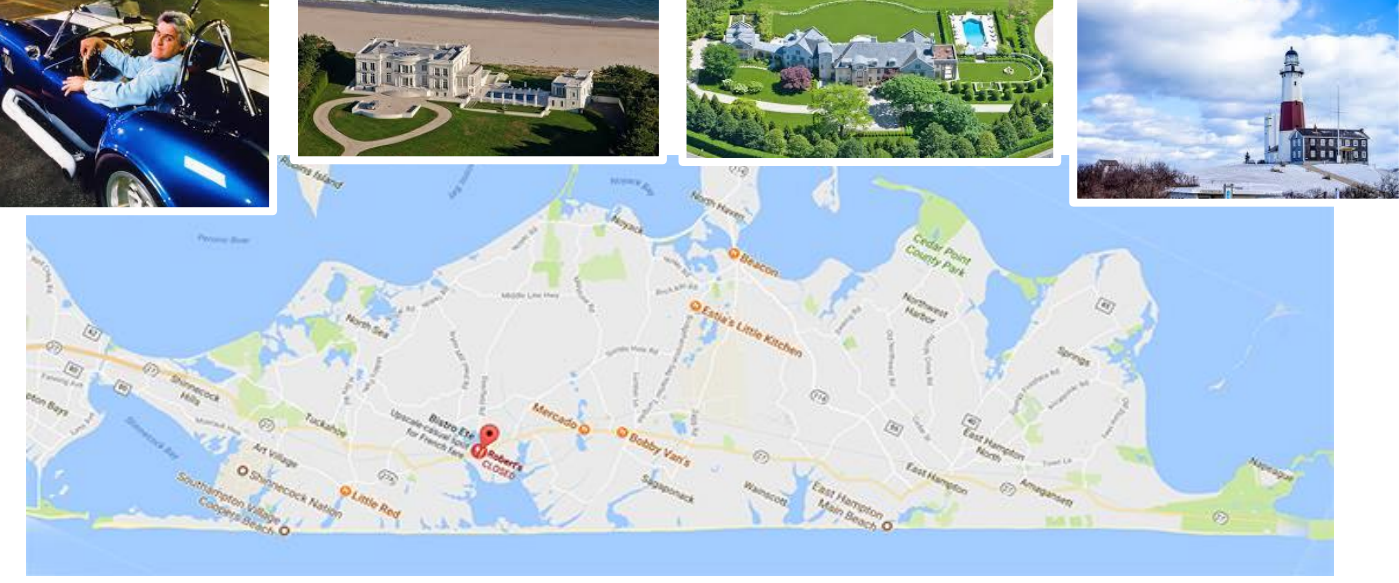
The Hamptons is the Center of Everything Year Round