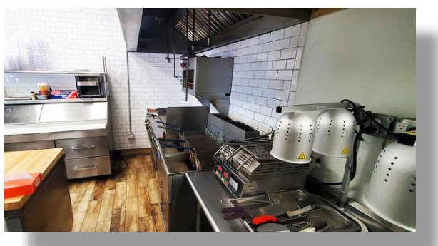
State of the Art Kitchen Equipment