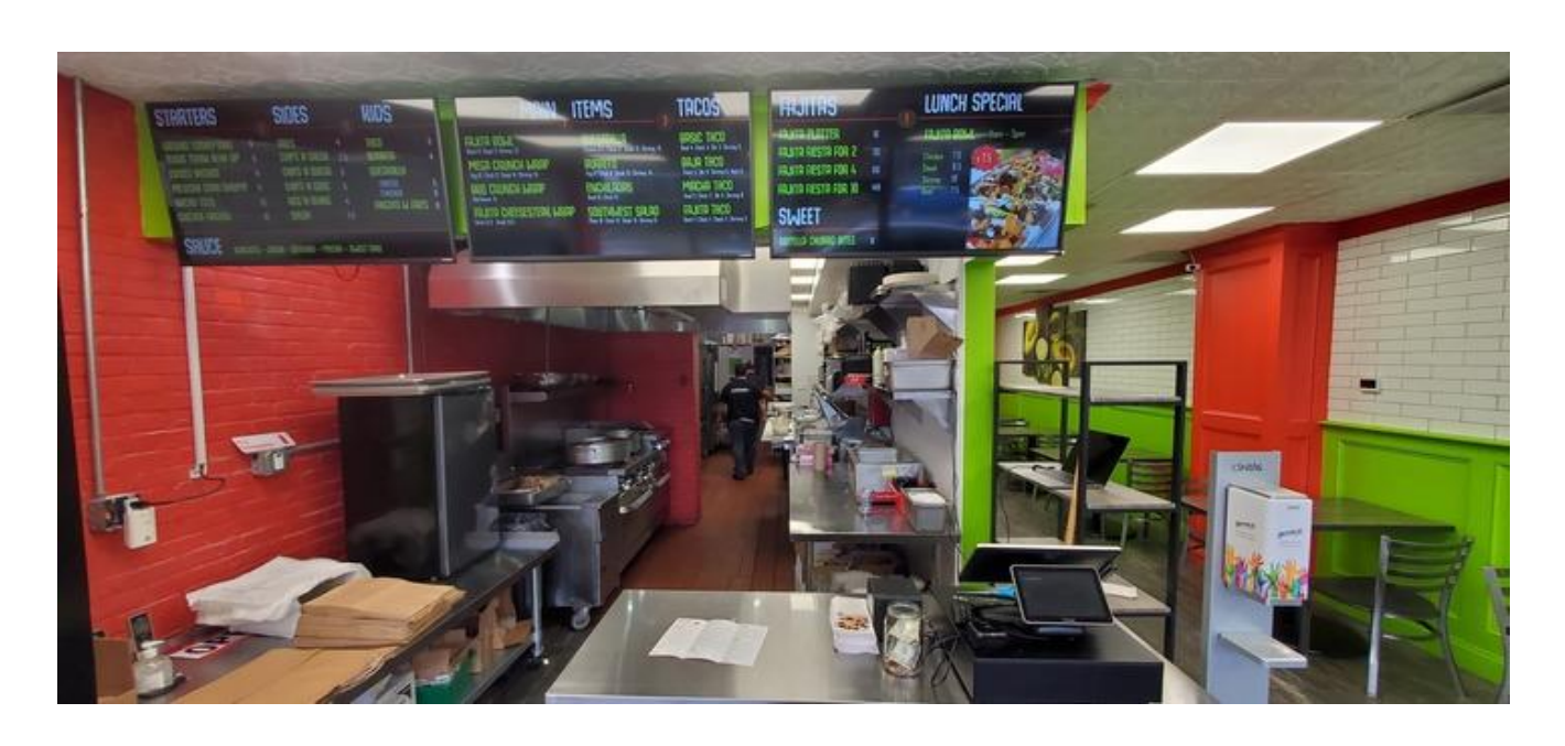
Integrated digital ordering and kitchen display system