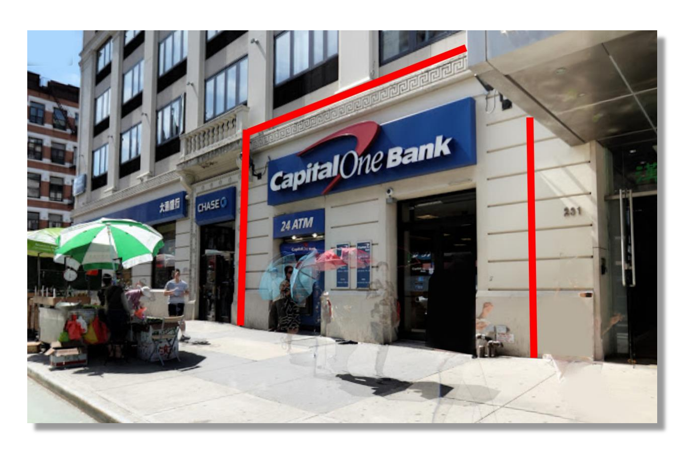
231 Grand Street Frontage 1,706 SF