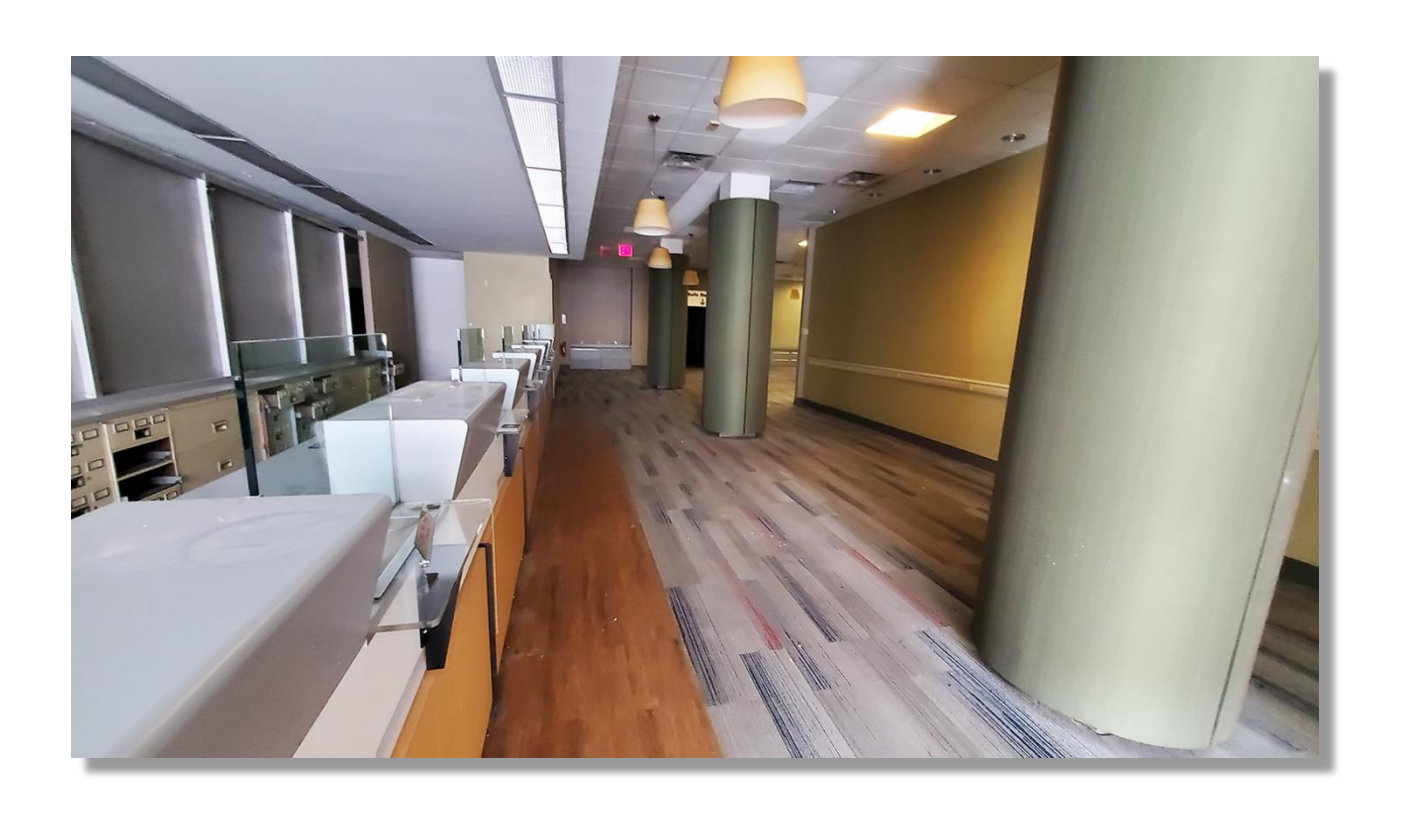
Former Bank Space Bowery Frontage 2,916 SF