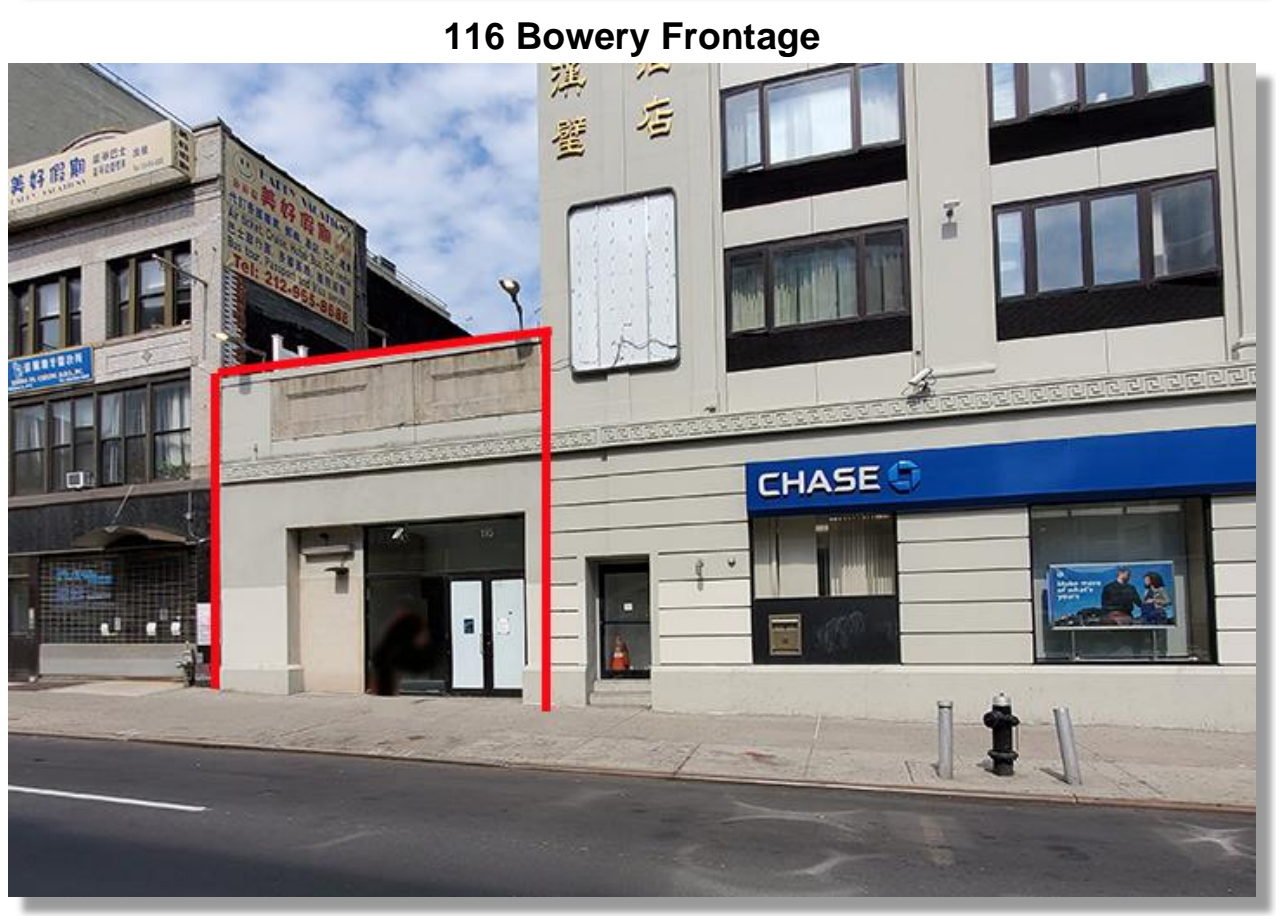
Page | 5