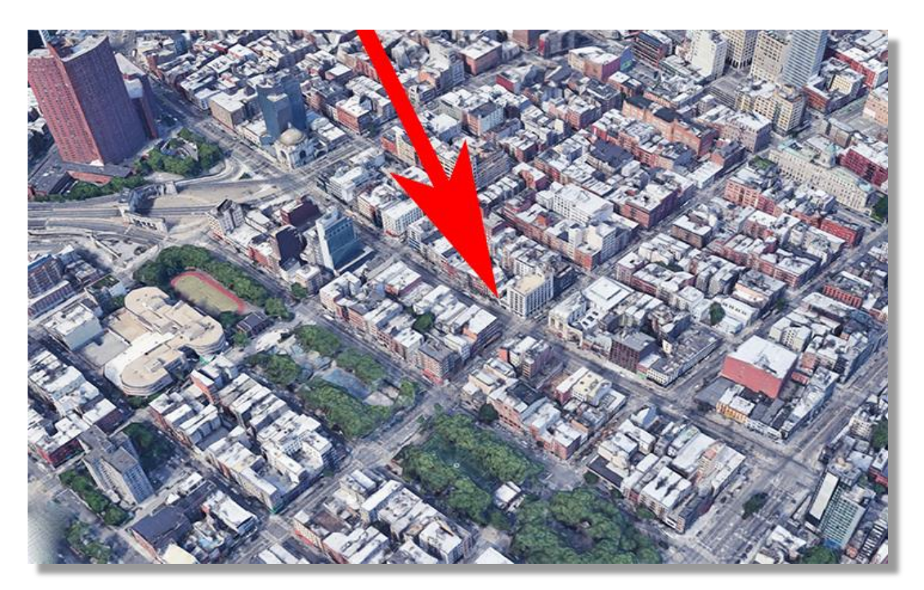
Location Right at the Intersection of Little Italy and Chinatown