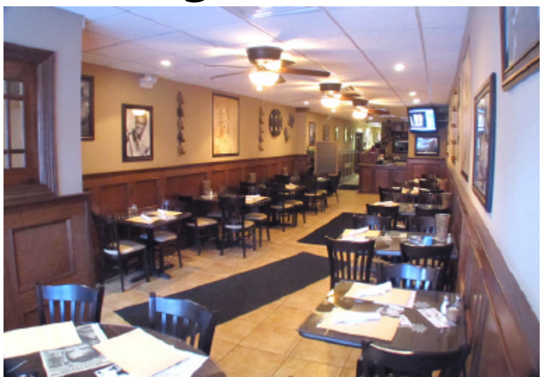
Rich and Attractive Buildout with full kitchen

70 Seats – 2,400+ SF + Bsmt Can Be expanded to 3,20<u>0 SF</u>