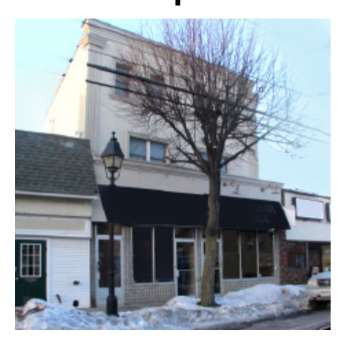
Plenty of Municipal Parking