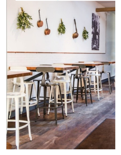
Healthy & Wholesome Happiness