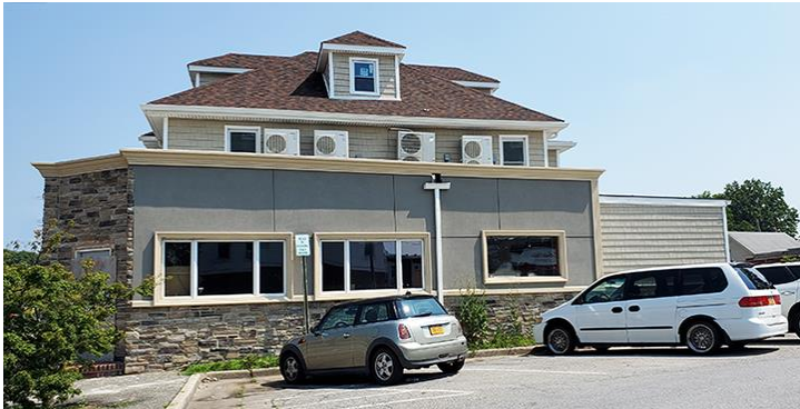
Ground Floor with Windows on 3 sides