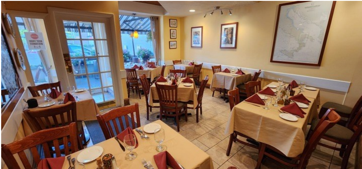
Excellent Location for a Chef Owner in this Affluent Town