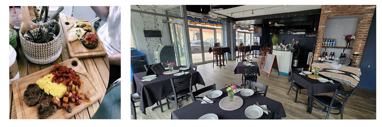
780 West Beech St., Long Beach NY