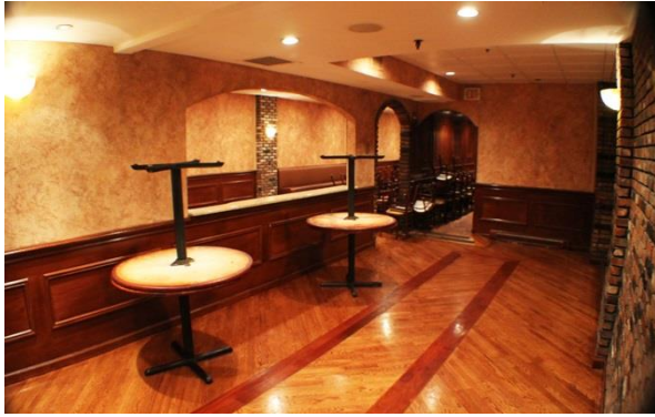
Ground Floor Private Dining