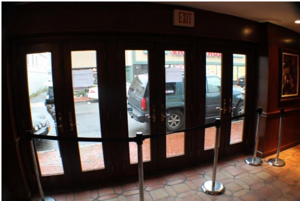
Front French Doors