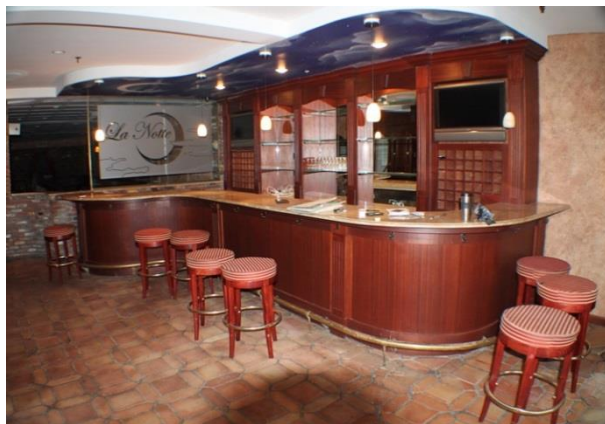
Ground Floor Bar