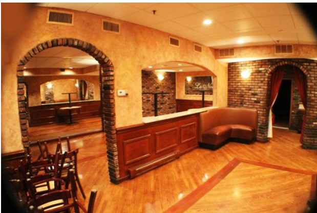
One of the Ground Floor Dining Areas