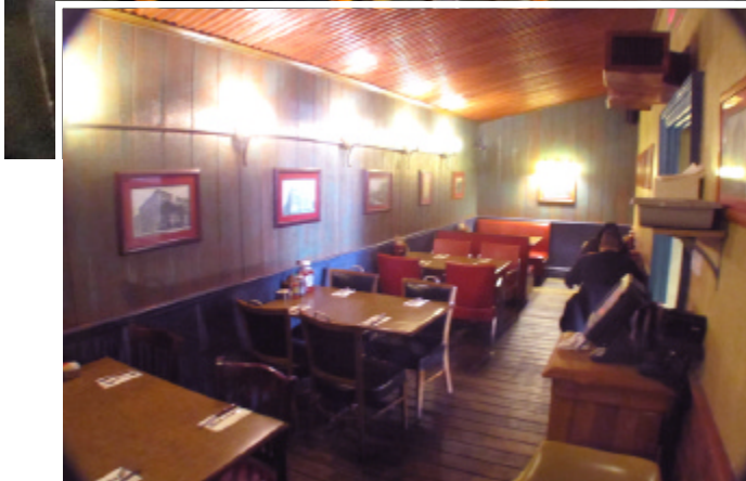
Rear Dining Room